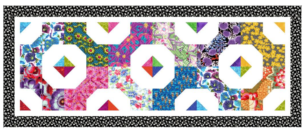
Border 1 = 1" Border 2 = 2"