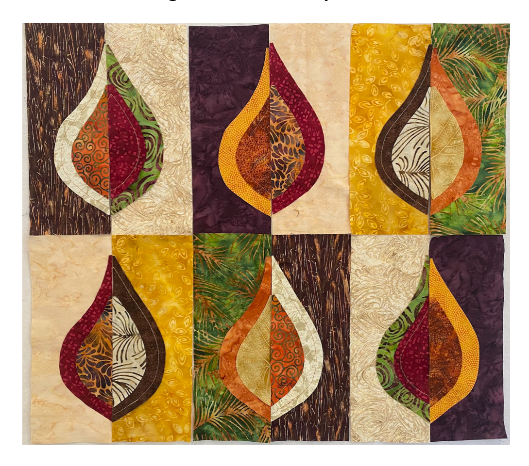
Falling Leaves Table Runner 49" x 17" 6 Full Blocks Border 1 = 1" Border 2 = 2.5"