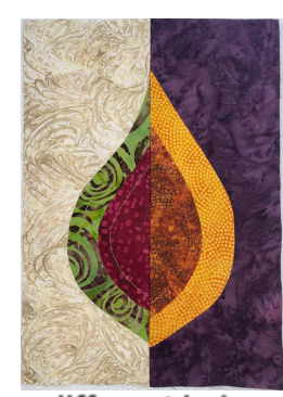
Example of two different halves sewn into one full Leaf Block