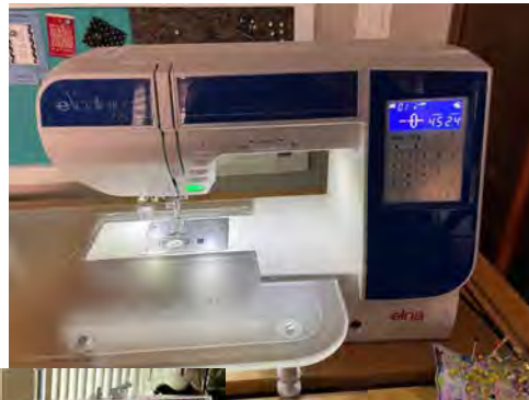
Elna Excellence 680 $500.00 Includes walking foot & multiple feet

Contact: Suzane Treneer streneer@me.com 760.458.8486 Happy to have you over to test drive the machines before your purchase