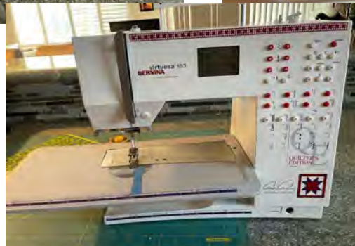
Bernina Virtuoso 153 Alex Anderson Classic Edition $300.00 Includes walking foot & multiple feet