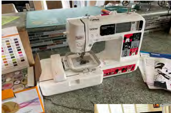
New Brother PE540D Embroidery machine $200.00 Includes box of new Brotherthread embroidery threads

Contact: Suzane Treneer streneer@me.com 760.458.8486 Happy to have you over to test drive the machines before your purchase